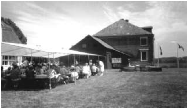
150 Knickerbocker cousins making the most of the first annual get-together at the old Schaghticoke mansion. (Is that the secret barbecued chicken I smell?)

The tremendous turnout at the 1st annual get-together at Schaghticoke on July 16th got me curious to see if there is enough interest to support a family newsletter. The crew at Schaghticoke provided a list of the attendees and this is the only way I have of helping their efforts from CT. I've volunteered to print at least 4 quarterly newsletters to get us to the next reunion. I will print what folks send in and have very little idea where we go from here. I am really depending on everyone to provide enough material (and suggestions) to make this work.