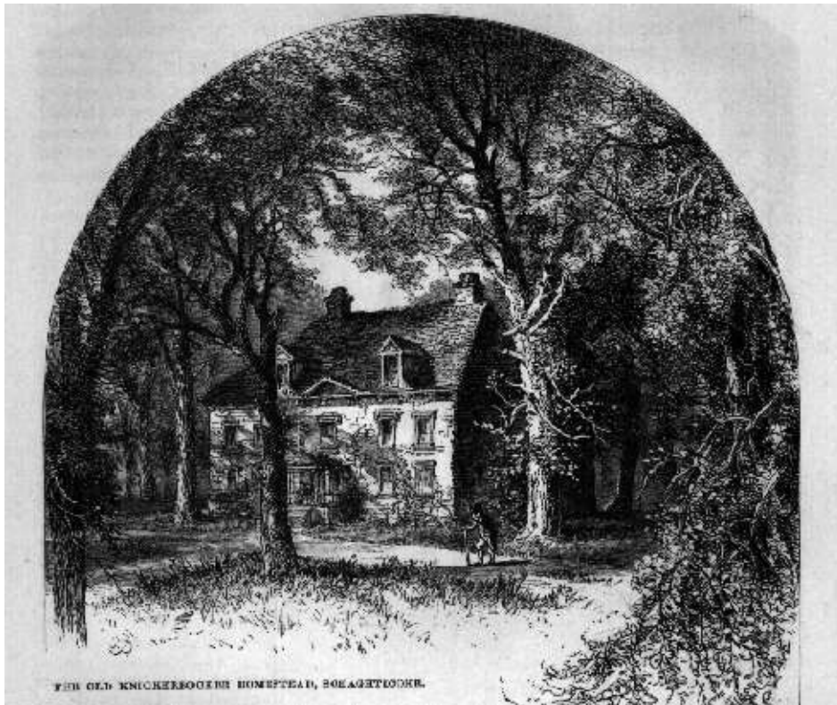
The Mansion at Schaghticoke - From Harpers Monthly , Dec. 1876